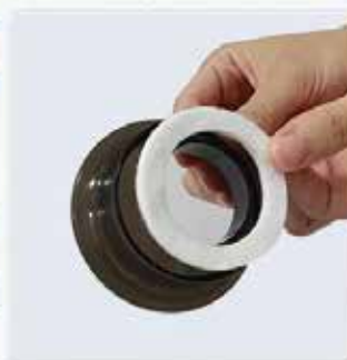
03 Replace filter cotton