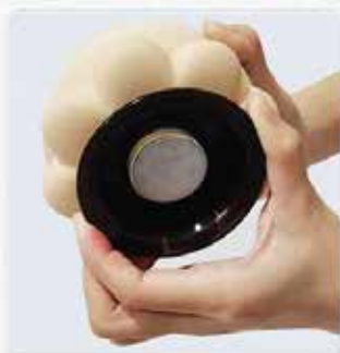
01 Twist clockwise