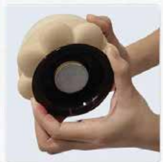
04 Anticlockwise rotation