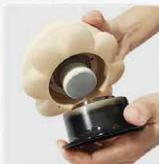
02 Twist clockwise